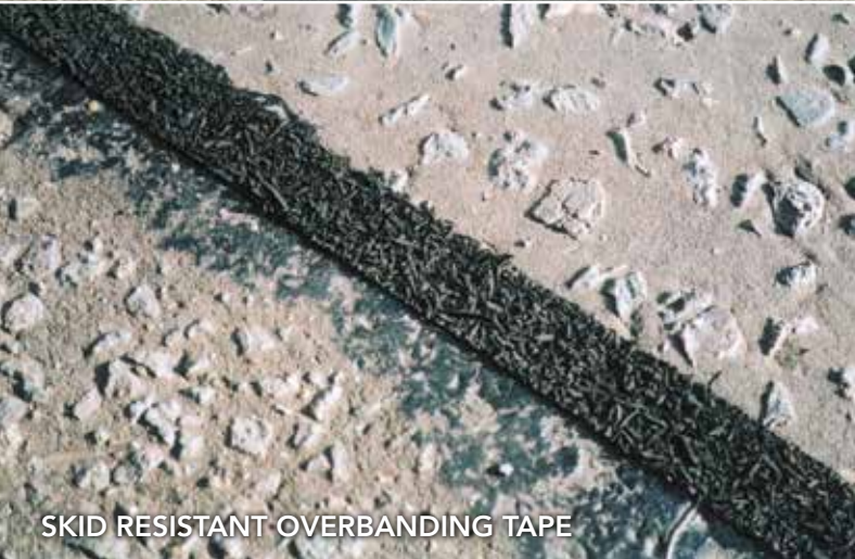
SKID RESISTANT OVERBANDING TAPE