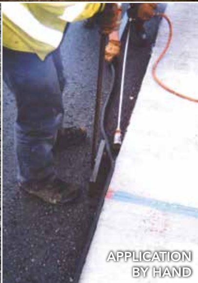
APPLICATION BY HAND